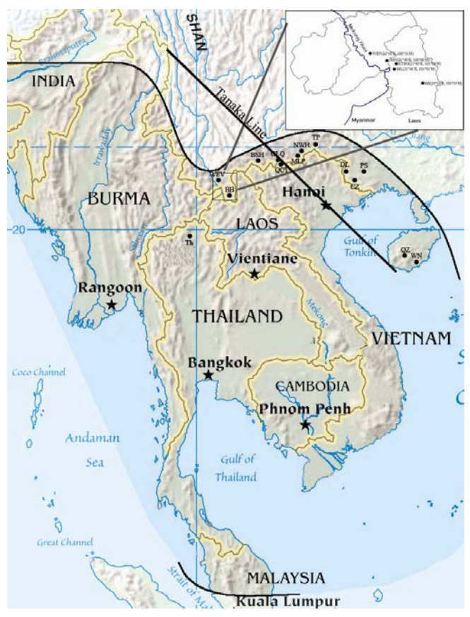
Fig. 3 The distribution map of Tacca chantrieri.

T. chantrieri, an endangered species (Fu and Jin 1992),