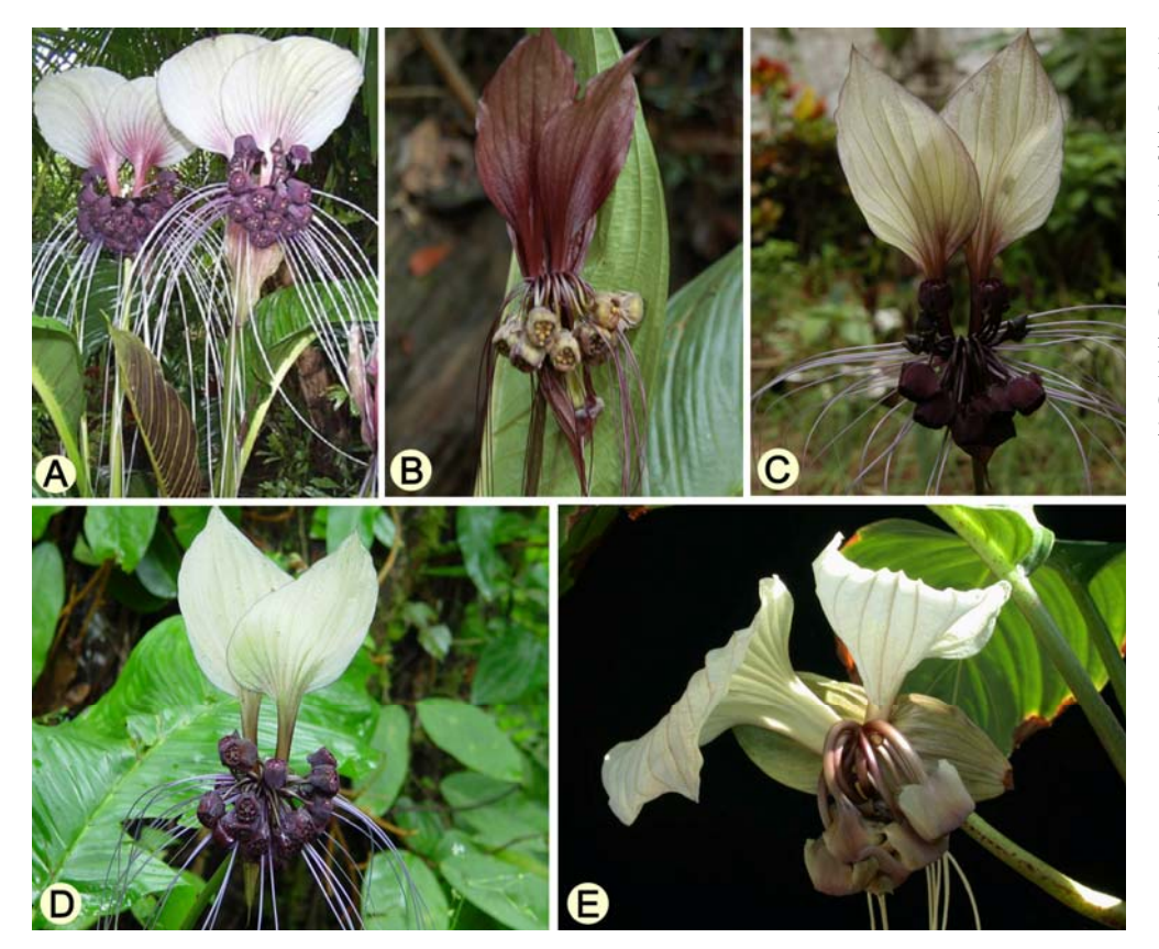
Fig. 2 Morphological variation of bracts of Tacca integrifolia from different places. (A) Cultivated plant (Nakara garden, Northern Territory, Australia) (Pauline Leafe). (B) Wide plant in Seramban, Malaysia. (C) Cultivated plant at XTBG (introduced from Medog). (D) Wide plant in Medog. (E) Cultivated plant in Medog. (E) Cultivated plant in Smithsonian Institution (introduced from Myanmar, W. John Kress). (Reprinted from Zhang et al. 2006b, with kind permission from Science Press, Beijing).

tial medicinal benefits, phytochemistry studies had been carried out. Scheuer et al. (1963) found T. leontopetaloides , contained \beta -sitosterol, ceryl ethanol and one unknown compound of Taccalin. Abdel et al. (1990) and Abdallah et al. (1990) also studied T. leontopetaloides and T. integrifolia , they found compounds from these plants had very good anti-cancer efficacy.