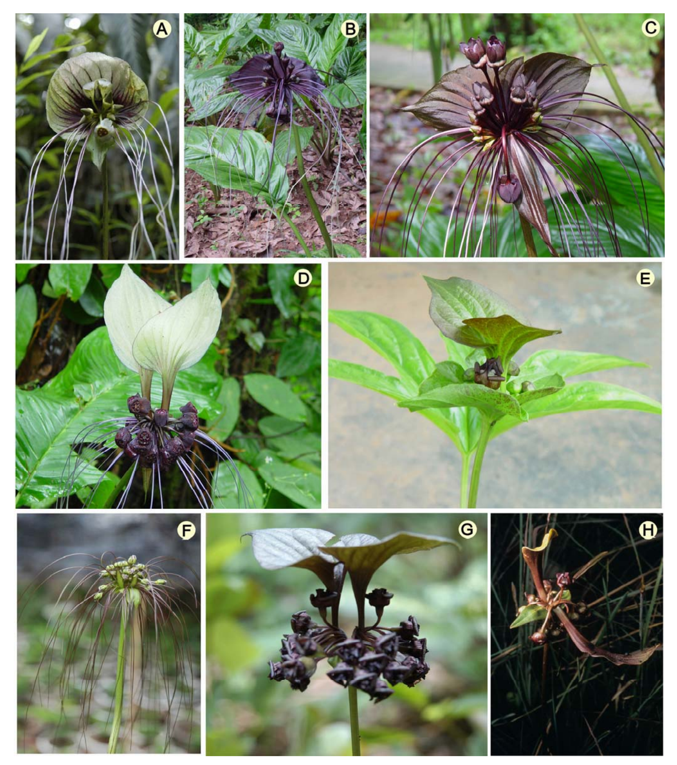
Fig. 1 The floral characters and habitats of Tacca species. Amazing different floral displays in Taccaceae. (A) T. subflabellata . (B) T. chantrieri . (C) T. ampliplacenta . (D) T. integrifolia . (E) T. palmata . (F) T. leontopetaloides . (G) T. palmatifida . (H) T. parkeri . (A, B, E, F, G) photos by Ling Zhang; (C, D) photos by Qing-Jun Li; (H) photos by Lisa M. Campbell.

ences of shape, color and size of bracts and plant sizes among the different regions and habitats (Zhang et al. unpublished data). T. integrifolia has a core distribution in southeastern Asia and disjunct populations in the upper Brahmaputra valley in Tibet, China. Significant morphological differences exist between these two distributional regions (Zhang et al. 2006b) ( Fig. 2 ).