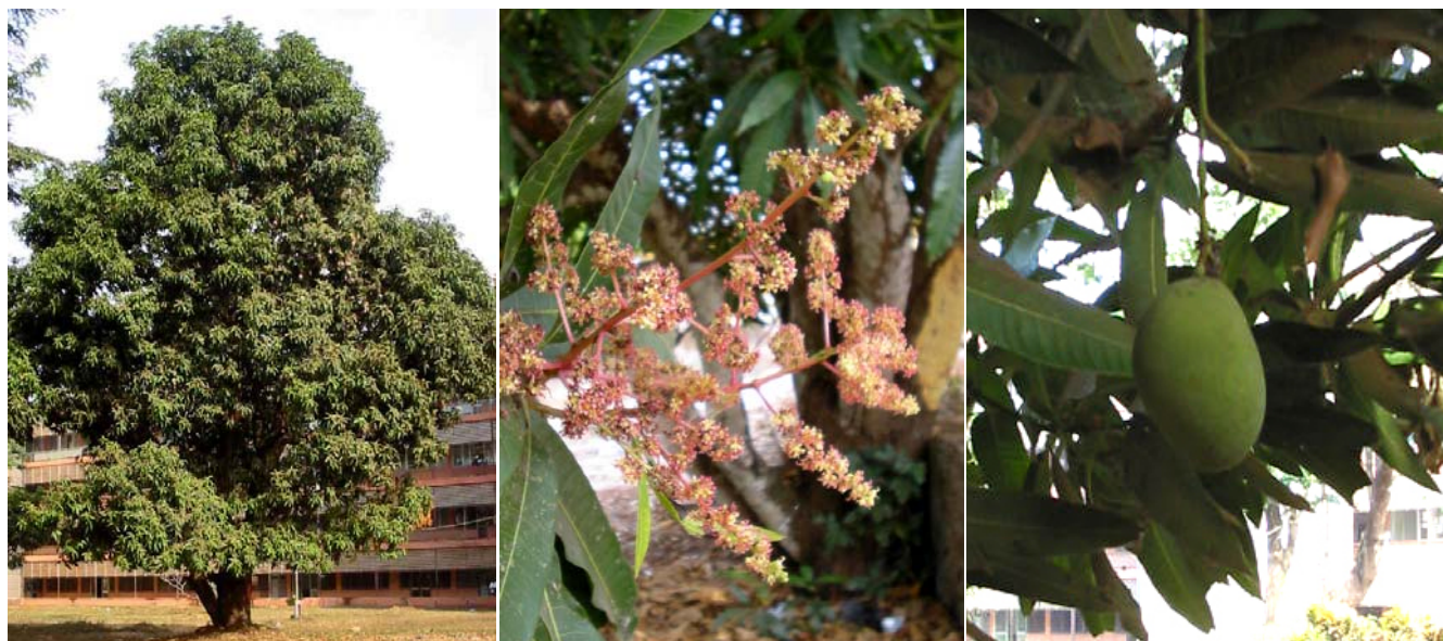
Fig. 1 Vegetative (left), flowering (center) and fruiting (right) stages of Mangifera indica, Conakry, Guinea.