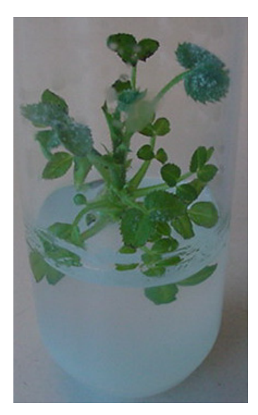
Fig. 2 Conidia production of a monoconidial Podos phaera pannosa isolate on a rose plant in vitro .

Besides the development of resistance screening methods applicable in a rose breeding programme to handle large populations, well characterized information on resistance (mechanisms and degrees) in parent plants and individual genotypes is necessary. Records on disease resistance for different fungal diseases are often made by field evaluations (Wisniewska-Grzeszkiewicz and Wojdyla 1996; De Vries and Dubois 2001; Ferrero et al. 2001; Carlson-Nilsson and Uggla 2005; Linde et al. 2006; Leus et al. 2007, 2008). However, the existence of different pathotypes, e.g. for powdery mildew, may influence disease severity scores. ITS sequencing showed that two different powdery mildew isolates can occur simultaneously in a test field (Leus 2005). Linde and Debener (2003) demonstrated by a screening on a differential plant set, that different pathotypes can occur in a small geographical region. Therefore, controlled artificial inoculations should give more useful information. Artificial inoculations with powdery mildew are difficult compared to most other fungal pathogens, since mildew is an obligate parasite and cannot be cultured on artificial media. In vitro plants are useful to maintain specific isolates and to produce inoculum (Fig. 2). The quality of the obtained spores as well as germination capacity and infectivity can be influenced by environmental factors as temperature and light