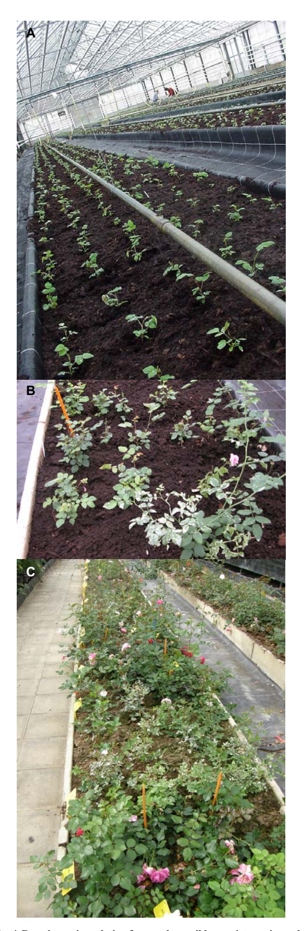
Fig. 4 Greenhouse inoculation for powdery mildew resistance in seedlings. (A) Transplanting of garden rose seedlings for greenhouse evaluation during the first selection year. (B) Infected inoculation or spreader plant in the foreground for inoculation of seedlings. (C) Example of resistant and susceptible seedling families in greenhouse selection after inoculation with inoculation plants.

of disease resistance, auxiliary methodology is needed. The earlier in the selection process disease resistance is evaluated, the more resistant genotypes will proceed in further selection and the sooner susceptible genotypes can be rouged. The difficulty in an early screening of seedlings implies an unreplicated evaluation stage likely to be different in environmental and growth conditions than normal production.