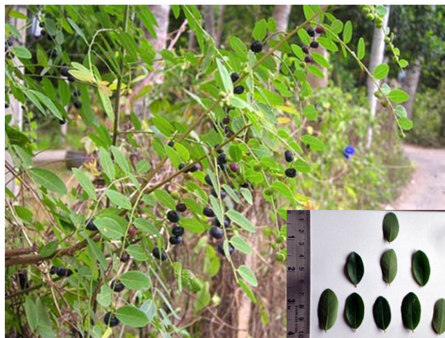
Fig. 1 Morphology of Kirganelia reticulata plant along with adaxial and abaxial surfaces of the leaf.

The outline of transverse section is dorsiventral type. The detailed transverse section shows epidermis (both upper and lower) cover the section both in lamina and midrib portion. The upper epidermis is covered with cuticle especially in lamina portion. The lamina portion exposes that palisade cells, covers half to one third portion of lamina. The bundles of vascular are well developed and exposed in midrib portion while those of primitive type are spreaded over the lamina portion, too. The surface preparation shows the anomocytic type of stomata. The trichomes are scarcely found on the top of section along the midrib. The epidermis (both upper and lower) is followed by hypodermis, composed of collenchymatous cells in midrib. In lamina portion, the palisade parenchyma cells are in continuation with upper