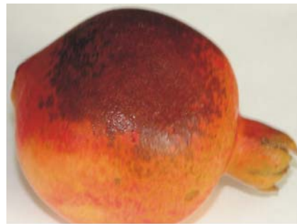
Fig. 2 Skin/sun scald symptom on pomegranate fruit.