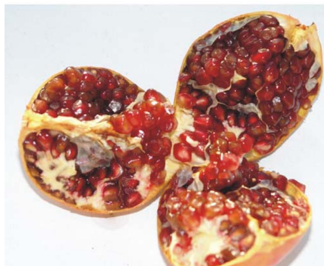
Fig. 3 Arils showing internal breakdown symptom.