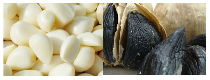
Fig. 1 Processed black garlic clove. Fresh white garlic (left) changed its color to black (right) by processing in a temperature- and humidity-controlled room for a month.