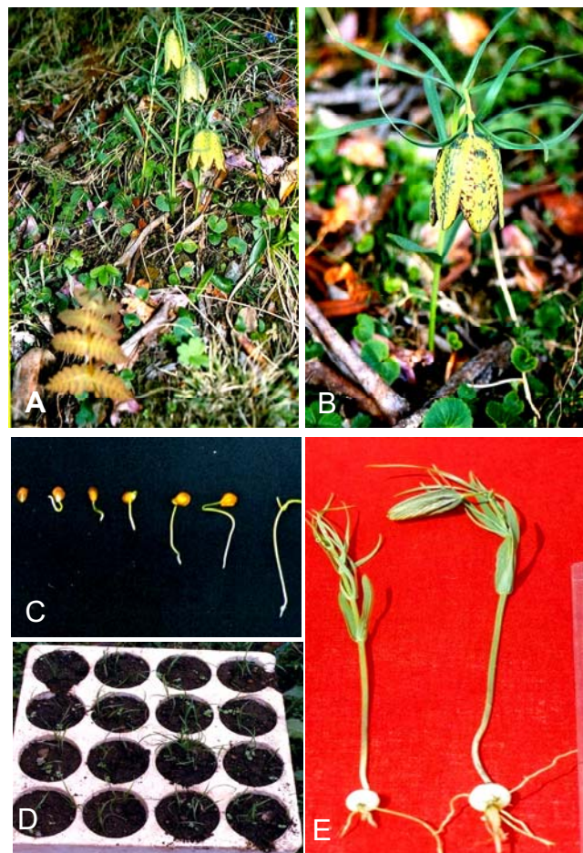
Fig. 1 Different stages of Fritillaria roylei . Mature plants growing in natural habitat (A, B). Seed germination in laboratory (C). Seedling development in seedling tray (D). Plants grown in nursery (E).

In their natural habitats, new leaves from buds of F. roylei started to emerge a few days after snow had melted, when temperature had increased slightly and one phenophase (vegetative or reproductive) of the lifecycle was complete (mid-April to September depending on the microhabitat, Fig. 1 ). Even buds were produced from bulbs at the time of