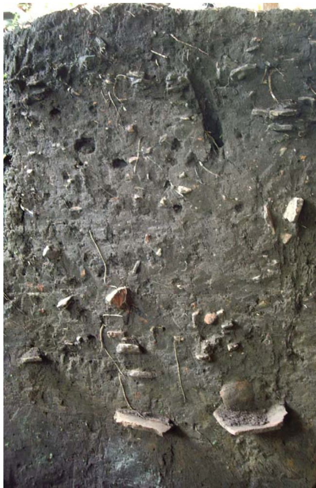
Fig. 1 Terras Pretas de Índio profiles and pottery artifacts found in these soils.

al. 2003). These archaeological Amazonian sites are characterized by dark soils with high fertility and agronomic potential, which is very unusual when compared to the surrounding highly weathered and very acidic soils of typically low fertility. The first aspect which draws attention to TPI soils, besides the color, is its richness in carbon, up to 150 \text{ g kg}^{-1} of soil, compared to 20 to 30 \text{ g kg}^{-1} in adjacent soils (Novotny et al. 2009). This additional carbon is presented mainly in pyrogenic form, being around six times more stable than other forms (Glaser et al. 2001). Also, the carbon enriched layer can reach a depth of 200 cm, averaging from 40 to 50 cm, while in surrounding soils this is limited to 10 to 20 cm. Therefore, carbon stocks in TPI can be much higher than in surrounding soils. Pyrogenic carbon results from partial carbonization (pyrolysis) of biomass and is rich in condensed polyaromatic compounds of low H/C and O/C ratios. These chemical characteristics confer to pyrogenic carbon high recalcitrance and resistance to thermal-, chemical, and photo-degradation (Novotny et al. 2009), which make this material very suitable as a carbon sequester or drainer.