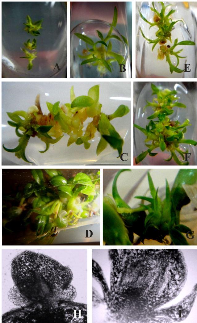
Fig. 3 In vitro culture multiplication through protocorm segments of Dendrobium chrysotoxum on 1/2 MS medium and its supplementation with organic growth supplements. (A) Shoot bud development in BH 50 g l -1 ; (B) Plantlet formation in BH 50 g l -1 supplemented medium; (C) Healthy pseudobulbous shoots in BH (50 g l -1 ) enriched medium after 17.40 weeks of culture; (D) Elongated roots with hairy out growths at their surface; (E) Development of shoot buds in P (2.0 g l -1 ); (F) Profuse multiplication of shoot buds and dense growth of plantlets P (2.0 g l -1 ); (G) Prolonged cultures showing development of multiple shoots; (H) Hand sections showing development of shoot buds in the form of small protuberance with formation of primary leaf primordium; (I) Growth of shoot bud showing secondary leaf primordium.

secondary leaf primordium and grew into a shoot bud (Figs. 3H, 3I). Growth and multiplication of pseudobulbous plantlets in the presence of growth supplemented medium was more as compared to control.