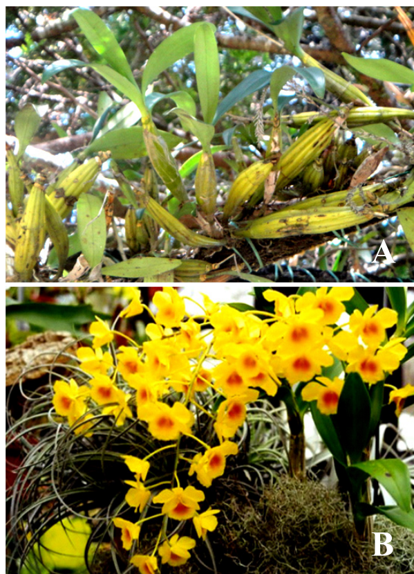
Fig. 1 Dendrobium chrysotoxum . (A) Vegetative form; (B) during anthesis.

The addition of organic additives to the culture medium