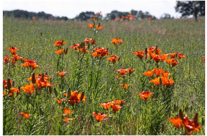
Fig. 8 Field with Lilium bulbiferum subsp. croceum near Govelin.

In the early summer of 2007 the author, after following the advice given, saw the orange lilies for the first time in their last remaining natural habitat ( Fig. 7 ). They were growing in the fields along the access road to Govelin, together with many of the other base poor sandy soil indicating species known from literature (Tüxen 1937). The weed plant community of Sclerantho annui-Arnoseridetum is the floristic part of the ecosystem of the poor sandy soils. From the faunistic part of the ecosystem ortolan bunting ( Emberiza hortulana ), the yellowhammer ( Emberiza citrinella ), the sky lark ( Alauda arvensis ), the wood lark ( Lullula arborea ), the golden oriole ( Oriolus oriolus ), the red-backed shrike ( Lanius collurio ) should be mentioned; in this place far away from noise of traffic. Red kites ( Milvus