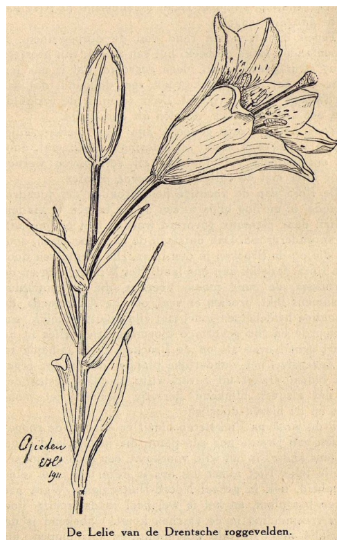
Fig. 3 Lilium bulbiferum subsp. croceum in Gieten in 1911. (Heimans 1916)

Agricultural intensification, through manuring and crop rotation proved to be too much for the orange lily. Deeper ploughing and the growing of potatoes severely reduced the numbers of lilies. During the harvesting of potatoes many bulbs were also uprooted. The bulbs of the orange lily were valuable and were sold to bulb-growers as an additional source of income. New editions of Dutch and German floras (Heukels and Rotmähler several editions) recorded the decline of the orange lily. The last article to describe the decline of the lily in the Netherlands by Heimans presented a vivid description of its fate. An international botanical and geological excursion in 1911 to North Drenthe reported that the, by then, very rare orange lily was found in a rye field near Gieten, the home village of the present author (Fig. 3) (Lefebvre 1912; Heimans 1916). Heimans emphasized that the digging of bulbs for selling to bulb traders, was an important reason for its decline. Bulb growers/traders were usually well aware of the presence of lilies and other geophytes in the fields (Reid 1989) and apart from a single recent discovery in 1973 (Weeda 1973) there were no new post 1911 records. The "persistent and ineradicable" lily was thought to be extinct.