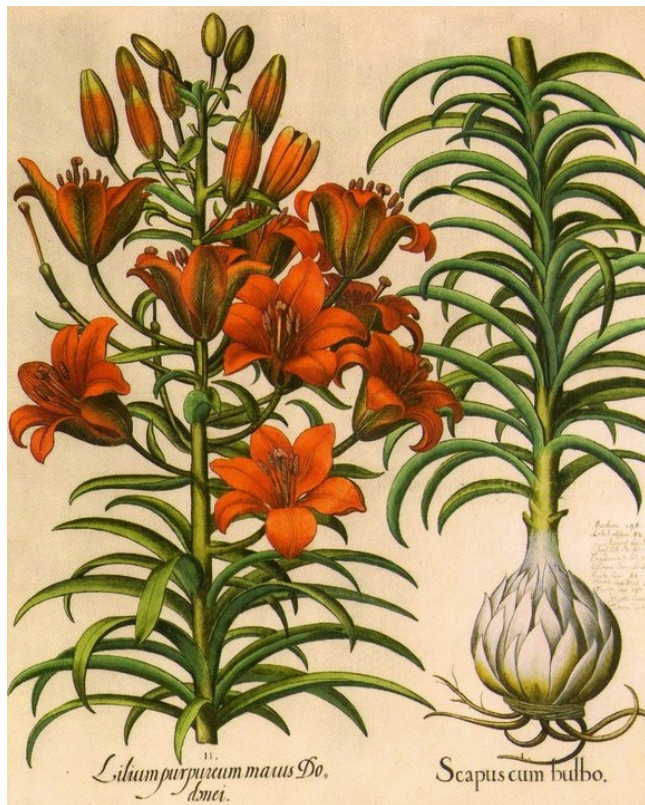
Fig. 4 Lilium bulbiferum subsp. croceum . (Bessler 1613)

sword and a white lily on either side of his head. To the right naked people in dramatic postures are thrown into the flames of hell by devils. On the left panel a group of naked people waiting serenely for their turn to be welcomed by St. Peter who is standing low on the crystal staircase to heaven. Higher up the staircase angels are distributing fine clothes. At the foot of the staircase grows the orange lily, the last flower to be seen on Earth before setting foot on the staircase to heaven! The Portinari Triptych (1476-1478) by Hugo van der Goes (ca. 1440-1484) made its way to Italy and is exhibited in the Uffizi Gallery in Florence/Firenze in the most famous room together with the elaborate paintings by Sandro Botticelli (ca. 1445-1510). The central part depicts the Adoration of the shepherds. In the foreground there are two beautiful vases with different flowers, one of them with an orange lily. The lily foreshadows the future sufferings of Christ (Koch 1964). The author disagrees with Koch that the sheaf behind the vases consists of wheat; it should be a sheaf of rye.