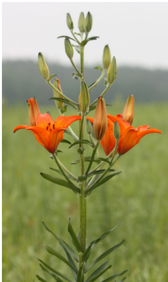
Fig. 7 Lilium bulbiferum subsp. croceum along the access road to Govelin.