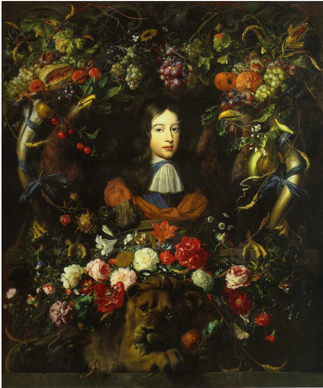
Fig. 6 Willem III (1650-1702), prince of Oranje-Nassau. Since 1688, the king of England. The orange lily in this painting from 1662 is the oldest known link to Dutch Royalty.