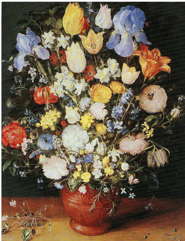
Fig. 5 Jan Breughel de Oude Terracotta Vase, 1605 containing 58 plant species with 72 varieties, Private collection.

blue forget-me-not; the colours of the Dutch national flag and the orange lily for the orange royal pennant. The range was chosen from the very common daisy to the very rare orange lily. The responsible artist started the project in 1993 just after the flowering time of the lily. Jaap van Tuyl from Wageningen University and Research Center, who had received over the years several lily bulbs from the author for research, could help. In the 20 th century, contrary to the 17 th , it is possible to force lilies to flower in time for the picture on the stamp.